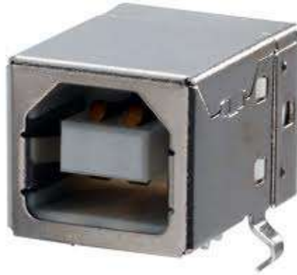
Figure 4-3 VNA-USB USB Type B Connector

The VNA is designed to communicate to a host computer/embedded device via a standard USB type B connector. Connection on the VNA is implemented using a standard USB cable.